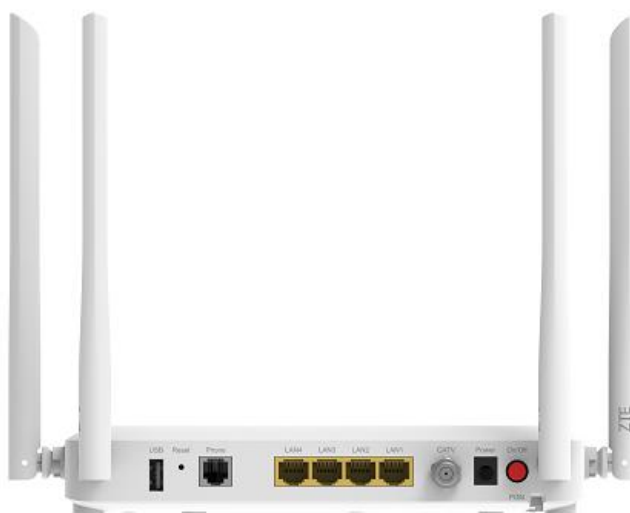
Table 3-1 Specifications for the Interfaces and buttons on the ZXHN F6600R