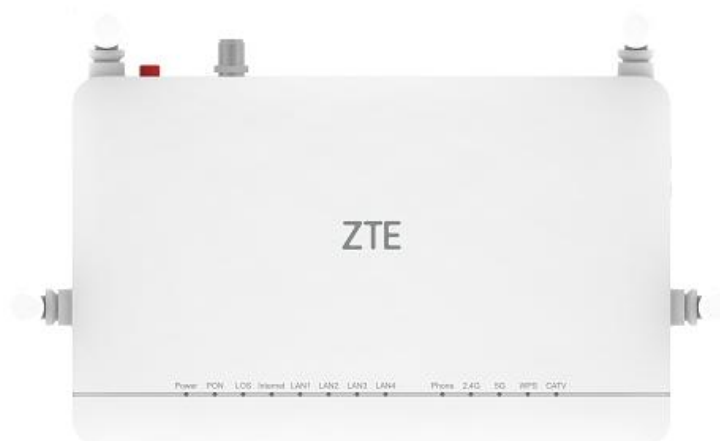
Table 3-3 Specification for the LED Indicators of the ZXHN F6600R