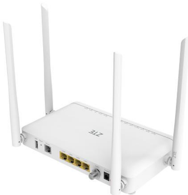
Figure 1-1 ZXHN F6600R Housing Design

2.488 Gbps downlink and 1.244 Gbps uplink. At the user side, it provides four GE ports, one POTS port, one USB 2.0 port, one RF port, and 2x2 802.11b/g/n/ax@2.4GHz & 2x2 802.11a/n/ac/ax@5GHz concurrent.